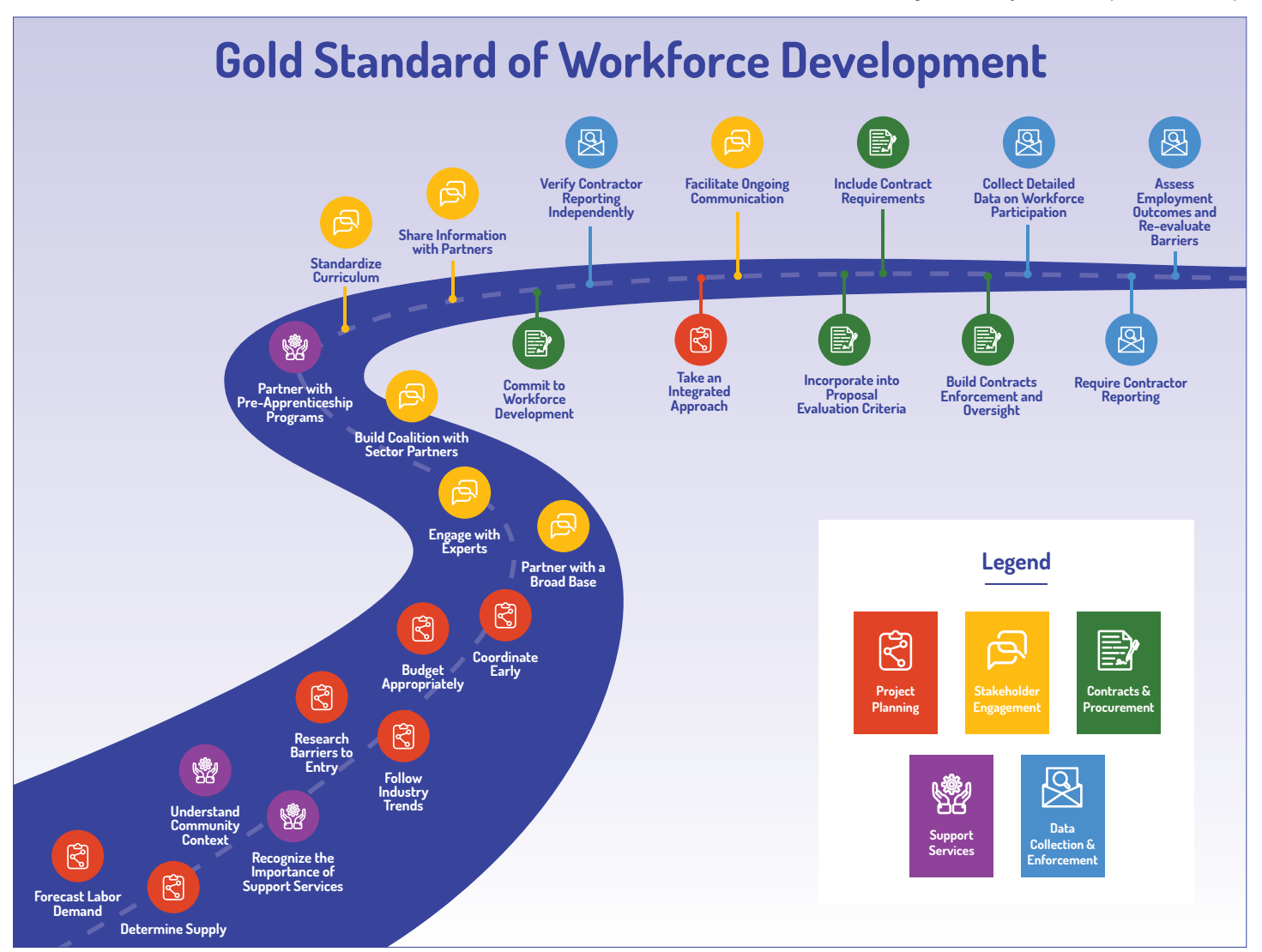
Figure 3: Workforce Development Roadmap

As can be seen in the roadmap below, the various tactics outlined in the above Pillars are executed in an integrated fashion, throughout the development of a project. This not only creates a comprehensive approach to workforce development on a project basis, but allows for an iterative program that adapts and learns from changing conditions. Every project owners' approach may be different, and users of this roadmap and Playbook should feel free to adjust tactics and strategies to fit their workforce needs and agency capabilities.