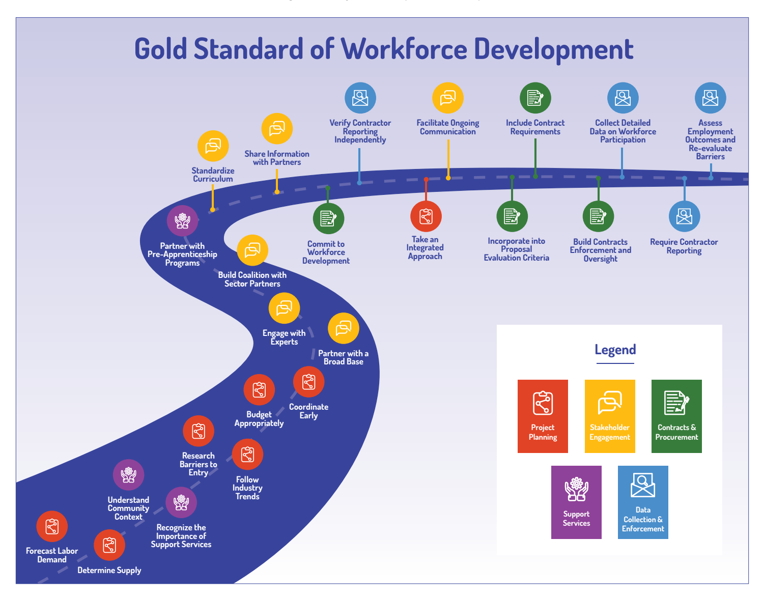
Figure 3: Workforce Development Roadmap

manner. A project or program properly integrating all Five Pillars is certain to contribute to the ability of local communities and families to access the prosperity these jobs are meant to provide.