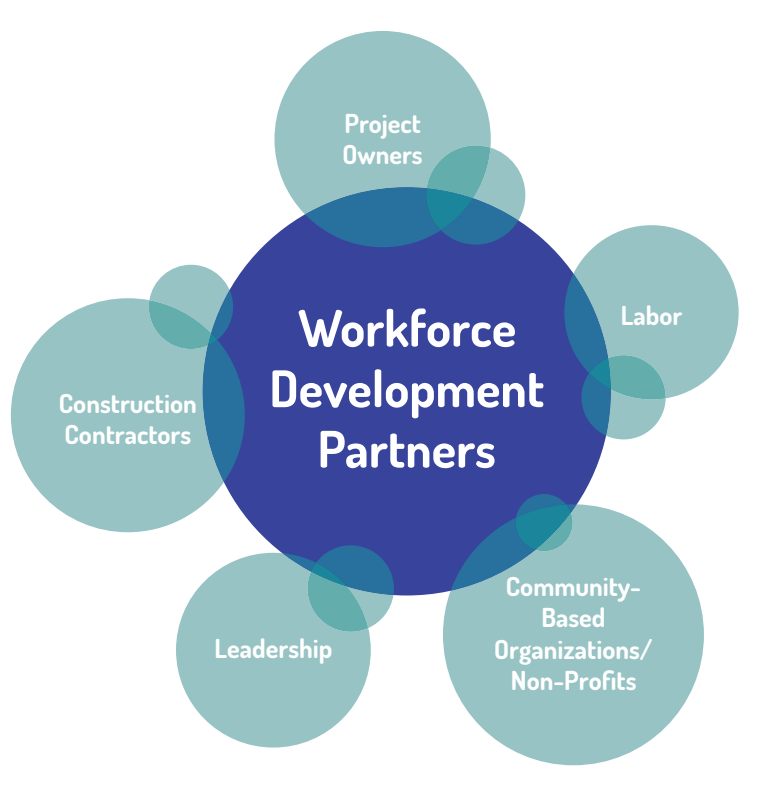
Figure 1 Workforce Development Partnerships

Successful programs are based on meaningful partnerships with local contractors, labor unions, community-based organizations, and non-profits or educational institutions who are already invested in and trusted by the local community. These partners will help project owners identify the needs of the workforce. It is necessary to clearly define the targeted community and tailor the program to the needs of that community so that the project owner's organization's goals align with community's goals.