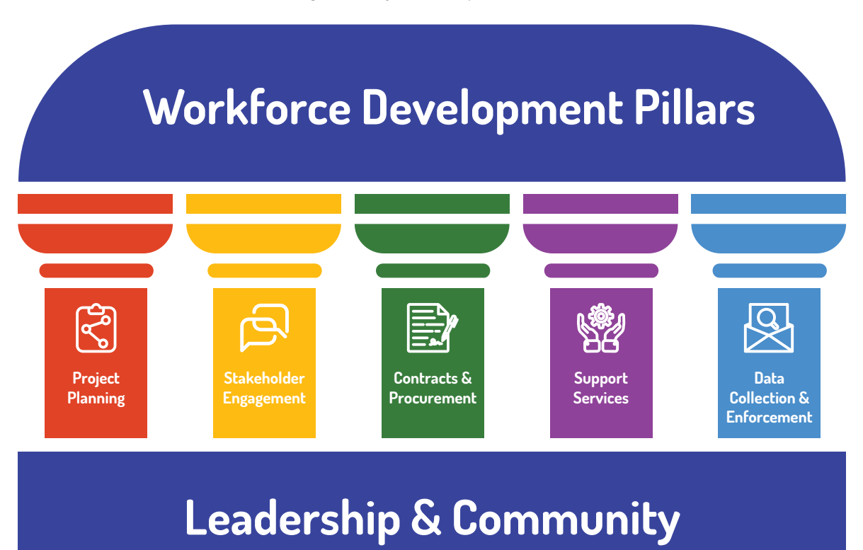
Figure 2 Workforce Development Pillars

The following table describes key insights for each Pillar provided by this Playbook.